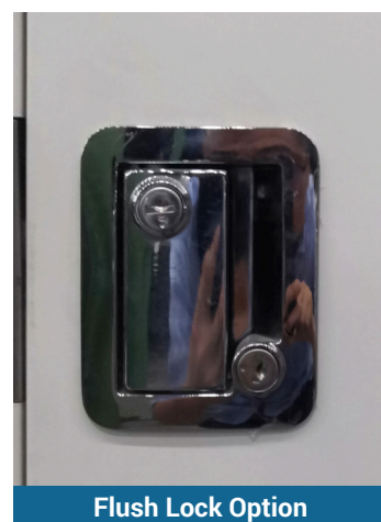
Flush Lock Option

For more information please visit our website: www.lathamsteeldoors.com.au or give us a call on +61 415 310 911